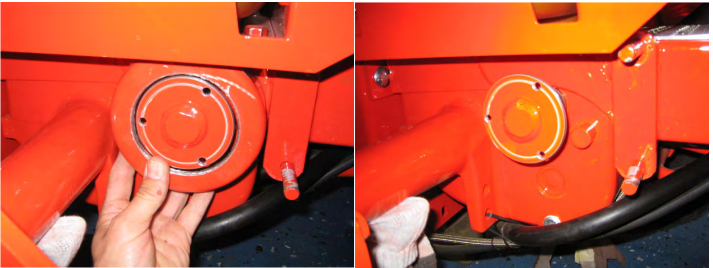
Cut the drum apart.