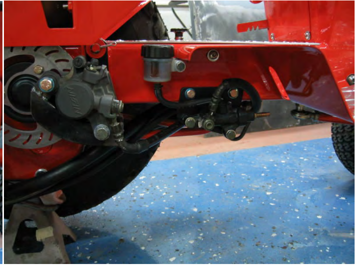
Yamaha master cylinder mounted.