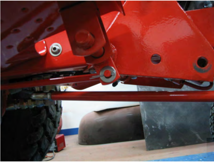
Flip brake rod bracket over.